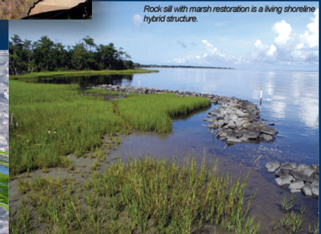
Rock sill with marsh restoration is a living shoreline hybrid structure.